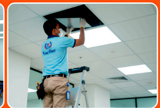
Heating, Ventilation & AC