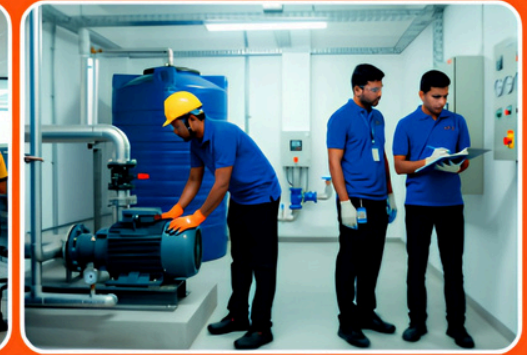
Equipment & Asset