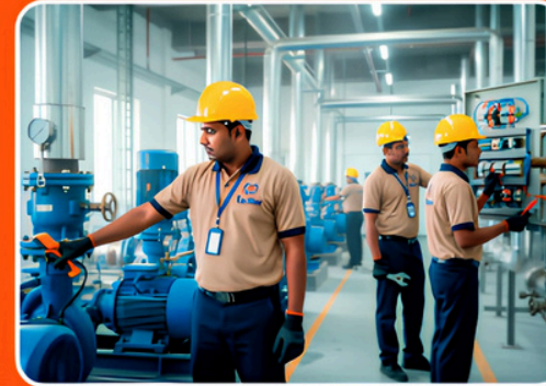
Energy Management Solutions