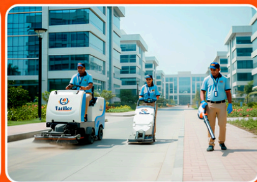
Office & Industrial Cleaning