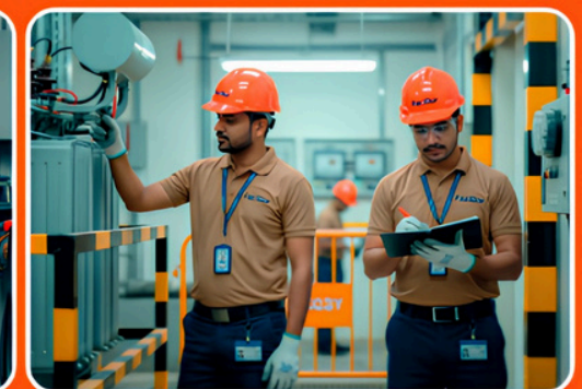
DG Set & Power Backup