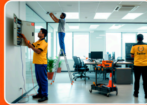
Preventive & Breakdown