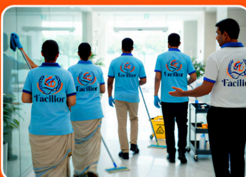
Pantry & Support Staff