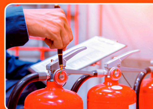
Fire Safety Maintenance