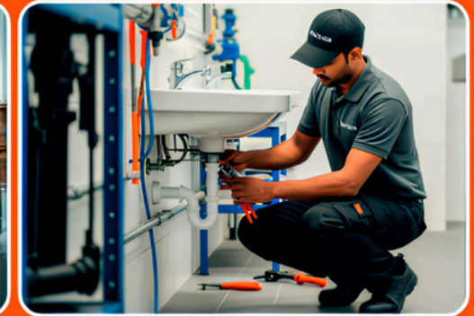
Facility Audits & Compliance