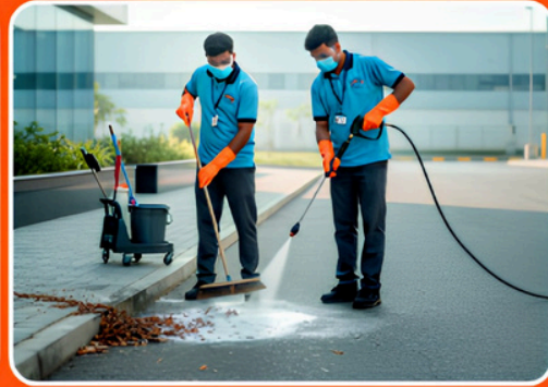
Access Control & Visitor